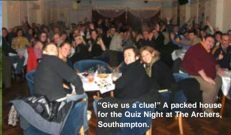
"Give us a clue!" A packed house for the Quiz Night at The Archers, Southampton.