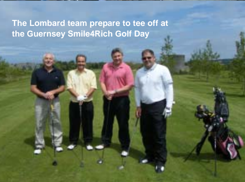
The Lombard team prepare to tee off at the Guernsey Smile4Rich Golf Day