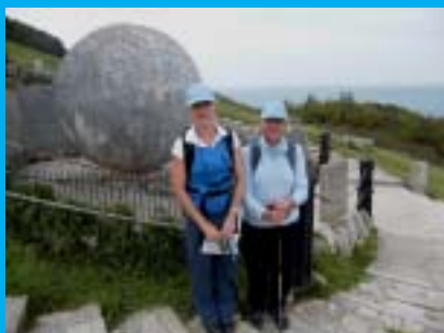
100-mile coastal walk funds vital research - p6

Issue 3 - October 2008 Kindly sponsored and printed by Colourspeed