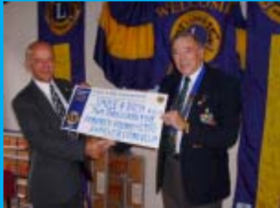
Swanwick Lions Club roars for Smile4Rich- p2