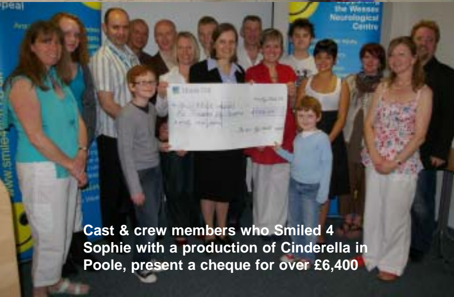
Cast & crew members who Smiled 4 Sophie with a production of Cinderella in Poole, present a cheque for over £6,400