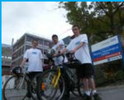
Lloyd & friends ride 'Memory Lane' - p4