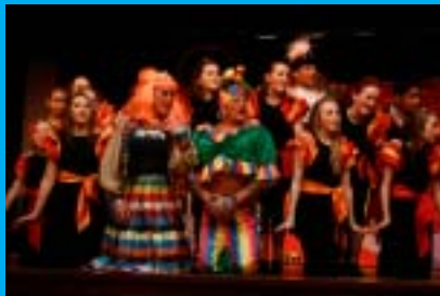
Panto raises more than a Smile 4 Sophie - p4