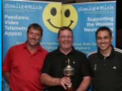
Pompey/Saints Legends go head to head- p2